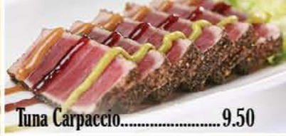
Tuna Carpaccio ..... 9.50