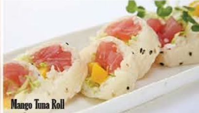
Mango Tuna Roll