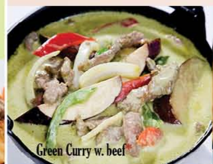
Green Curry w. beef