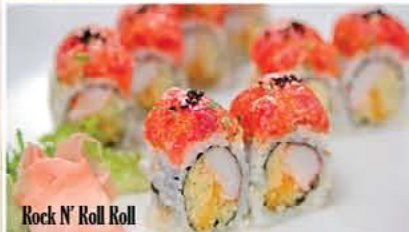
Rock N' Roll Roll