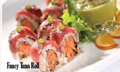
Fancy Tuna Roll