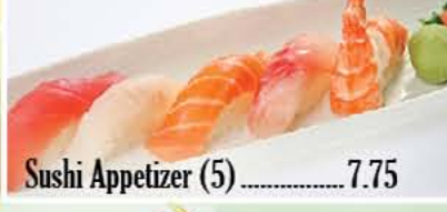
Sushi Appetizer (5) ..... 7.75