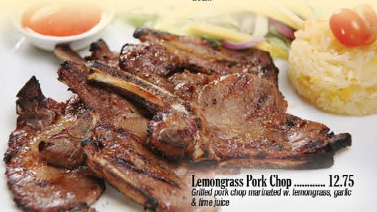
Lemongrass Pork Chop ..... 12.75 Grilled pork chop marinated w. lemongrass, garlic & lime juice