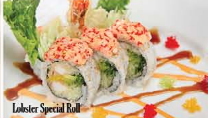
Lobster Special Roll