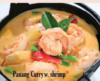
Panang Curry w. shrimp*