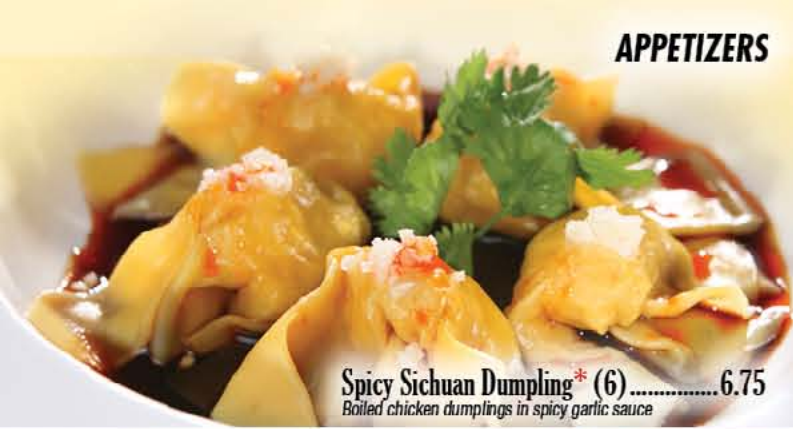
Spicy Sichuan Dumpling* (6) ..... 6.75 Boiled chicken dumplings in spicy garlic sauce

Edamame ..... 4.50 Boiled green soy bean