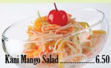
Kani Mango Salad ..... 6.50

Seaweed, cucumber, kani, tempura flake and masago