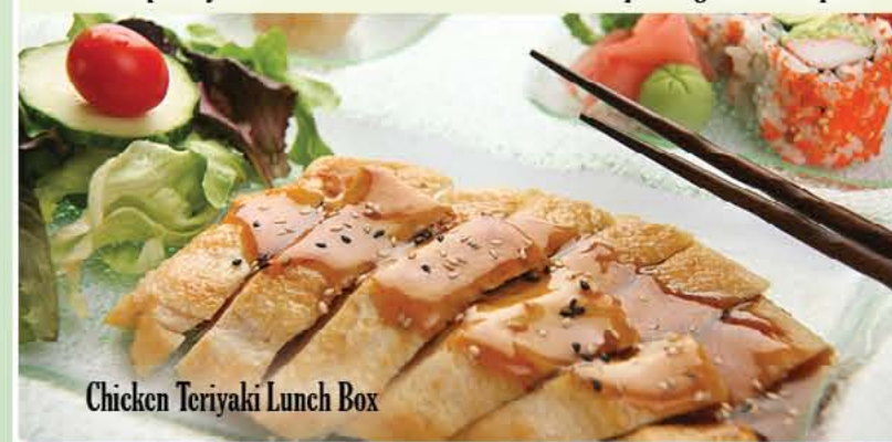
Chicken Teriyaki Lunch Box