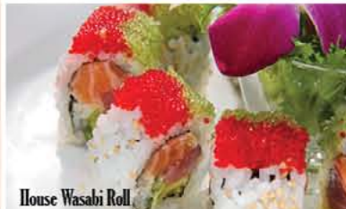
House Wasabi Roll