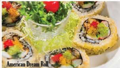
American Dream Roll

Design & Printed By CB Graphics & Printing, Inc. © Copyright 09/11 917-886-6322