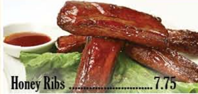
Honey Ribs ..... 7.75