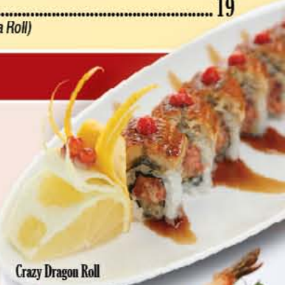
Crazy Dragon Roll