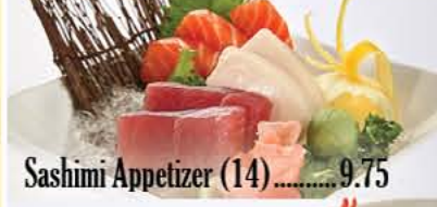
Sashimi Appetizer (14) ..... 9.75