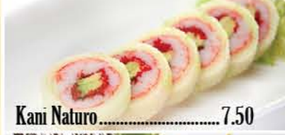
Kani Naturo ..... 7.50