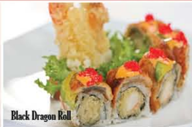
Black Dragon Roll