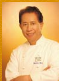
Martin Yan Master Chef, Host of Yan Can Cook, Founder of Yan Can Restaurant