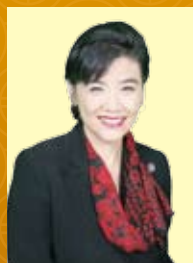
Judy Chu Member of Congress Honored Guest & Keynote